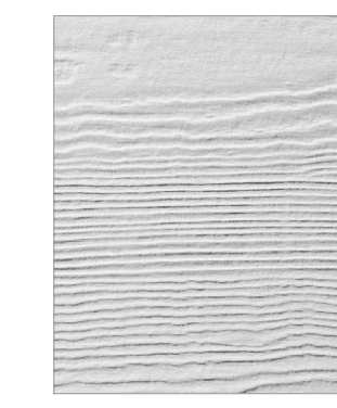
COLOR: ARCTIC WHITE