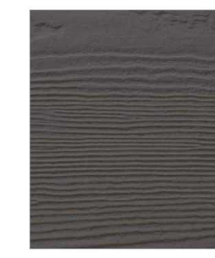
COLOR: RICH ESPRESSO